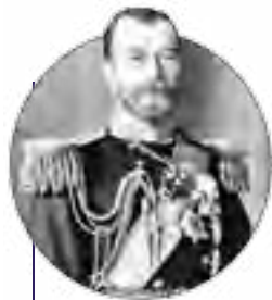
Tsar Nicholas II