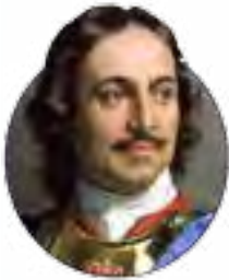
Tsar Peter the Great

After years of civil unrest and centuries of turmoil, hundreds of thousands of Russian workers, housewives, and students filled the streets of Russia's capital, Petrograd, and marched in protest of Tsar Nicholas II's autocratic rule in February of 1917. These civilians' actions began the Russian Revolution—a series of violent uprisings spanning from February to October that ended the Romanov dynasty, established the world's first Communist state, and changed the world forever.