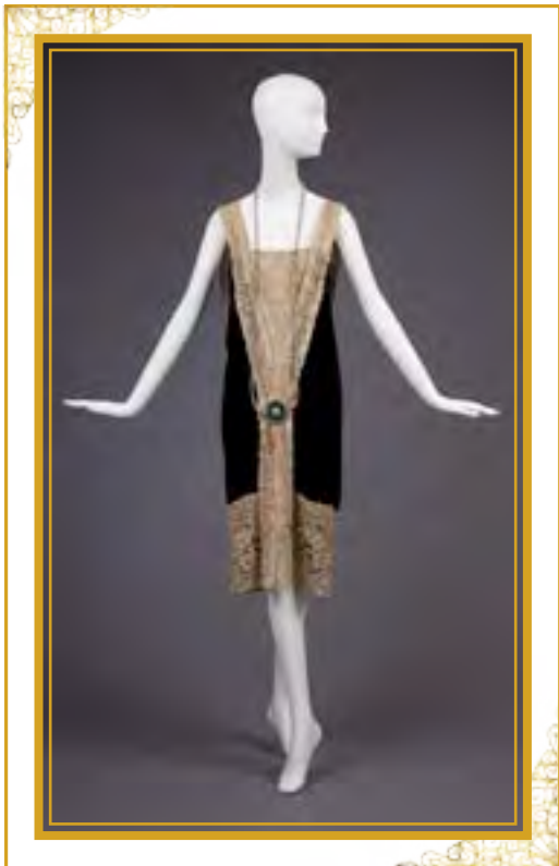
Above images: 1920s inspiration for the new design.