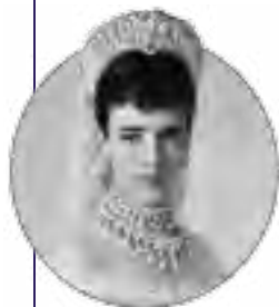
Dowager Empress Maria Feodorovna Romanova

to leave Russia. Only in 1919, at the behest of her sister Alexandra, did she leave Russia for England. Soon after, she returned to her homeland of Denmark where she died at the age of 81.