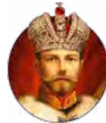
Tsar Nicholas II

While the Tsar initially reacted to the pressure from these events by renouncing and weakening his absolutist rule, it didn't take long for him to go back on his word and restore his own power. Much of the next decade played out under the Tsar's "White Terror," in which thousands of people were executed for dissent, or for holding views that went against the Tsar and his policies.