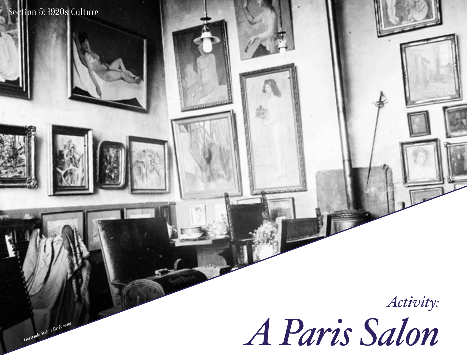
Gertrude Stein's Paris home