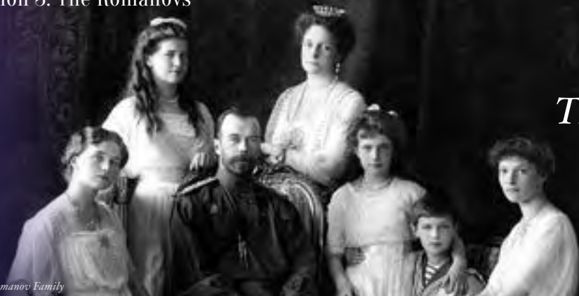
The Romanov Family