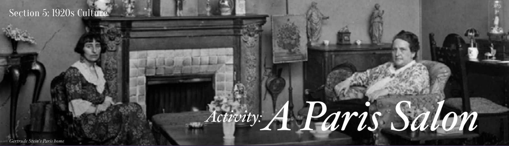
Gertrude Stein's Paris home