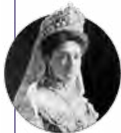
Tsarina Alexandra Feodorovna

Nicholas, there was much conflict between her and Dowager Empress Maria especially when the healer Rasputin entered their lives. Alexandra and Nicholas' only son, Alexei, suffered from hemophilia—the “royal” disease that afflicted many descendants of Queen Victoria.