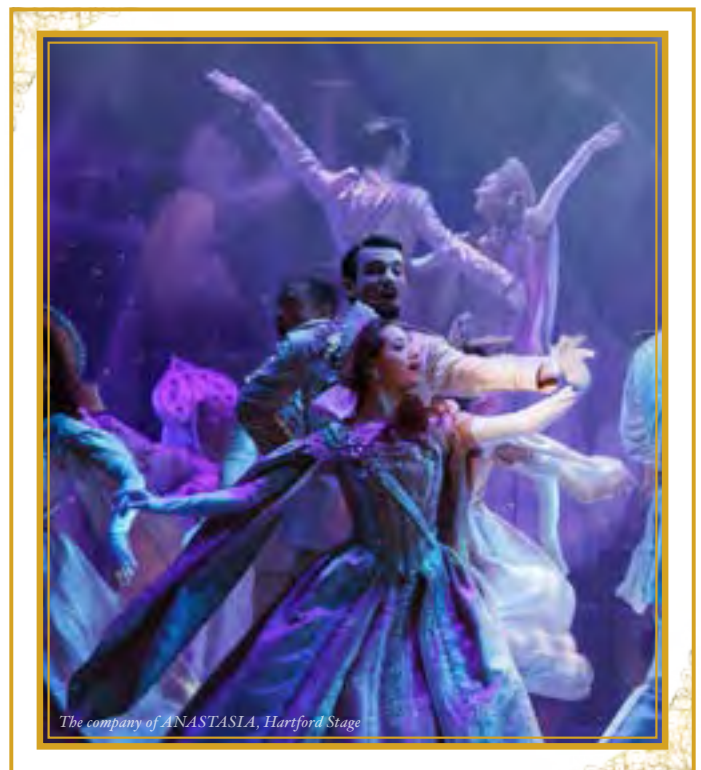
The company of ANASTASIA, Hartford Stage